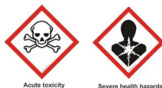
Figure 2. Hazardous product symbols excluded by collection systems