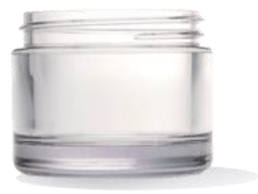
Figure 1. 'Cristal™ One' technology by Eastman Chemical.