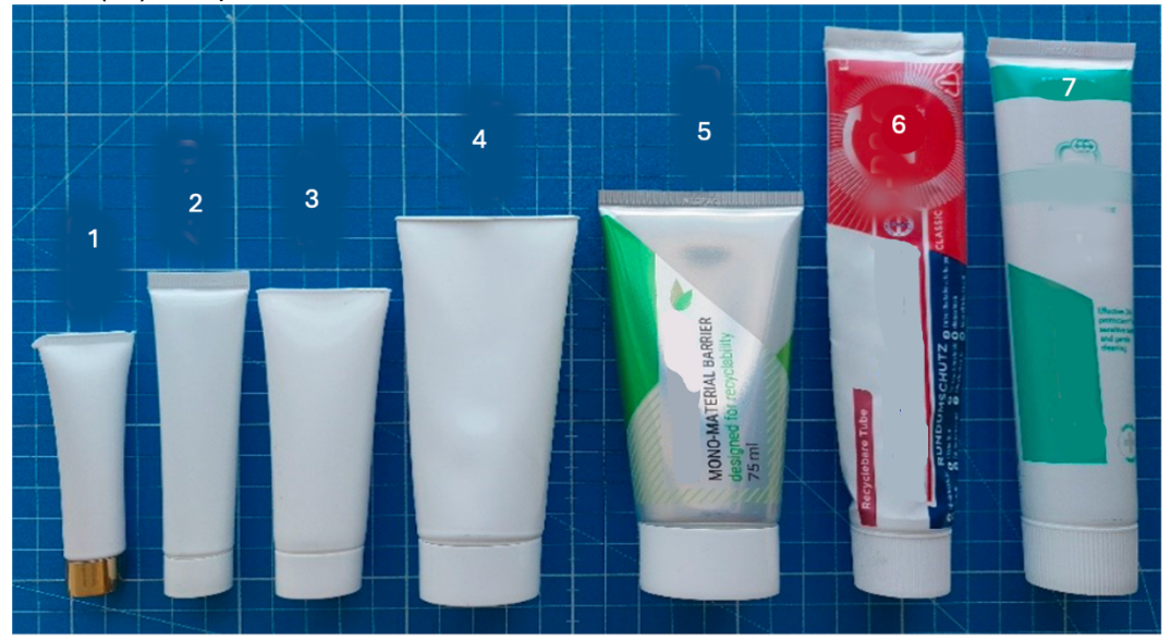
Test 2 (T2) Samples