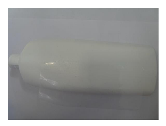
Figure 1. PP top clear with Acrylic adhesive, Film Thickness \leq 60 \mu m by Avery Dennison without cap and unprinted.