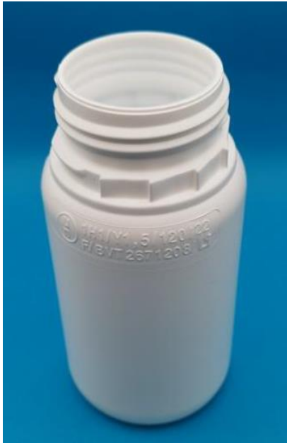
Figure 1. 'Advanced In-Mould Fluorination' deposit on inner surface of HDPE container by IPACKCHEM