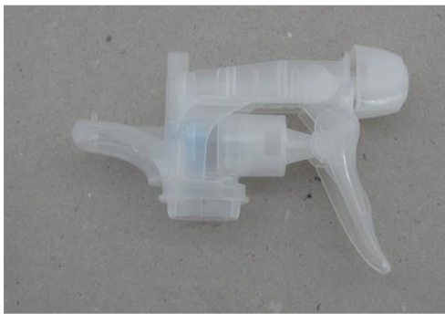
Figure 1 Trigger SprayerSP09R by Silgan Dispensing